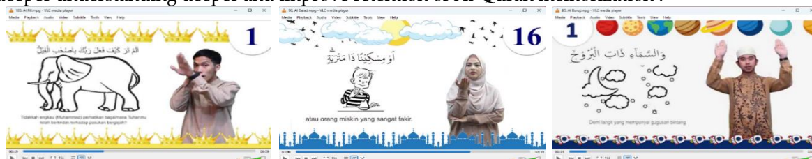
Figure 3. Video recording of the implementation of the multisensory approach in memorizing the Al-Quran by combining audio, visual and kinesthetic.