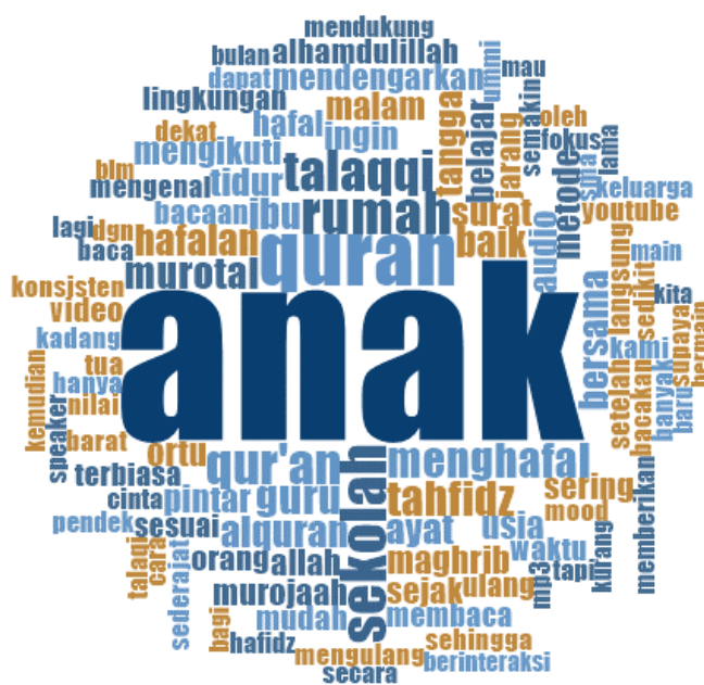
Figure 1. NVivo 12 Word Cloud display of Word Frequency Query results, interview transcript data and survey results.

The NVIVO 12 Word Frequency Query data or words that are frequently repeated in the interview transcript data and survey results , it is then displayed via the NVivo 12 Word Cloud feature. As seen in Figure 1: