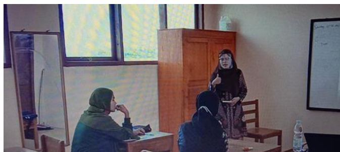
Figure 2. Teacher Give a Thumbs Up to The Students

The picture above is displayed when the teacher gave a thumb up to a student because her answer was true. The teacher always made this gesture so that the students had accustomed to that.