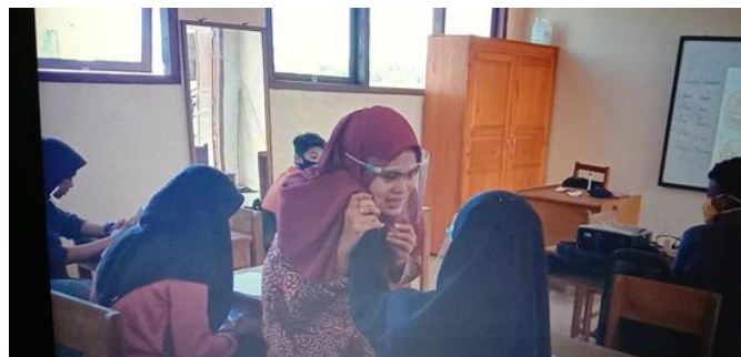
Figure 3. The teacher used tadoma

Using tadoma in the teaching and learning process is very useful for students with hearing impairment besides using sign language, gesture, written language, tadoma strategy would help students to understand what the teacher said. The teacher used this strategy when the students had difficult to read lips language and the way the teacher implemented this tadoma strategy was by put the student's finger along the teacher's jaw. Below is the picture when the teacher used tadoma as follow: