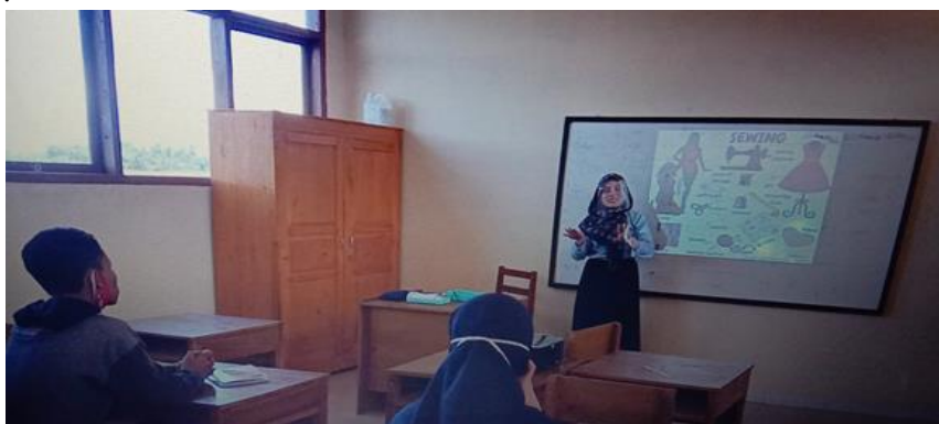
Figure 1. The teacher put both fingers in front of the chest (Sign Language)

There were two types of sign language the teacher and the students used in class during observation. They were sign language based-word and sign language based-alphabet. Sign language based-word would be translated by one word per sign. This sign language used by teacher to explain the lesson to the students and also as a way to tell the meaning of English words to students. The teacher explained the picture machine and the meaning of words "sewing machine" the teacher did two sign, and they were put both fingers in front of the chest and put both hands like a table shape, as the pictures showed below: