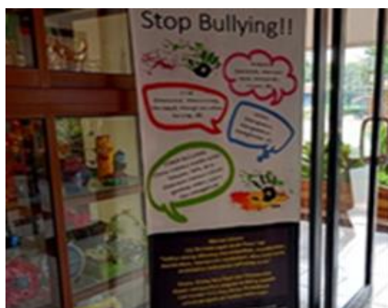
Figure 4. Posters about Anti-Bullying Schools

From the description above, each school had different strategies to prevent bullying. However, generally there was a campaign to stop bullying by sticking banners or distributing stickers and posters at every school, as shown below. This was all done so students could see and understand that bullying is bad behavior. It seemed that before, many students still did not realize that mocking is part of bullying and could cause the victims to be depressed and ostracized by their friends. In response to that, the schools also promoted anti-bullying behavior through posters, stickers and pamphlets (see Figure 3 for anti-bullying poster).