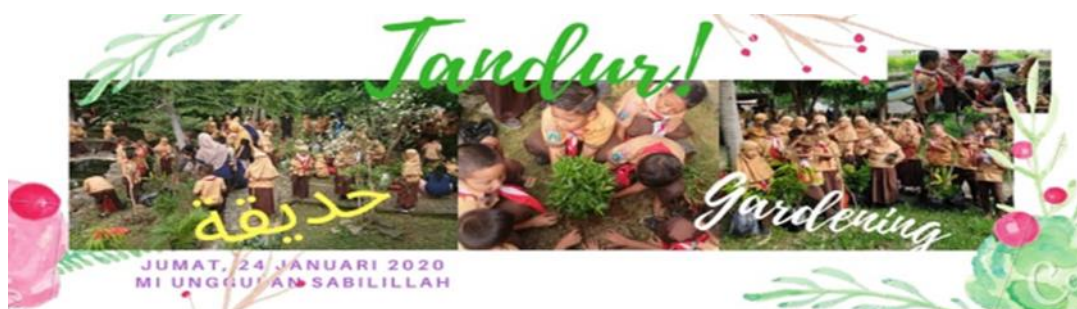
Figure 3. Comfortable School Environments

got meaningful and impressive learning activities" (Annie, interview, 2002). Such activities were called life skill education (see Figure 2 for gardening activities at school).