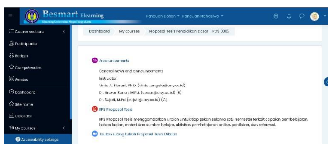
Figure 2. Display of Besmart E-Learning

Figure 1. showing the synchronous student lecture process using Zoom, it was found that the majority of students activated the camera and delivered presentations independently. Zoom is one of the online video conferencing media, it can display the faces of students and lecturers so that interactions can be well established. The use of Zoom aligns with Herwin et al. (2021) stated that synchronous learning more often relies on online face-to-face meetings via Zoom to form independent learning.