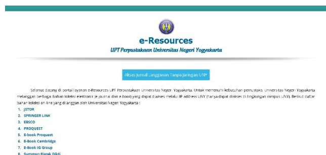
Figure 3. Display of UNY e-Resources

Figure 3. shows the UNY Library e-Resources view. E-Resources is a facility obtained by UNY students to be able to access the e-Resources of UPT Yogyakarta State University Library. To meet the needs of students, Yogyakarta State University subscribes to various electronic collection materials (e-journals and e-books) which can be accessed via UNY's email account. This facility can make it easier for students to access various e-journals and e-books from home. In addition to using the e-Resources provided by UNY, students also use Google Scholar. Google Scholar is a facility provided by Google since 2004. It is a service that allows users to search for textual topics in various publication formats. Google Scholar provides an easy way to search academic literature (Widianto et al., 2021).