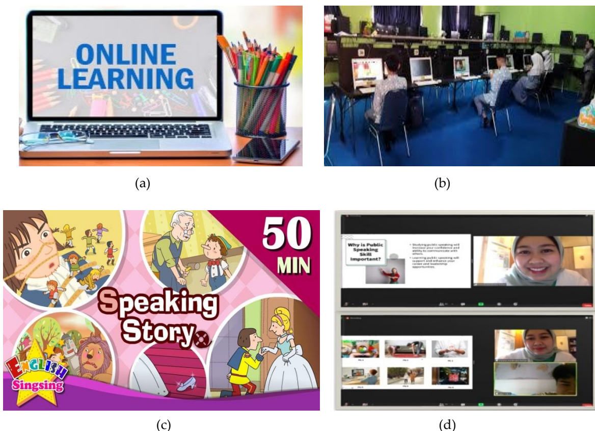
Figure 1. Project Based Learning-Using Online Digital Media

Theoretically, the findings empirically confirm a variety of previous literary arguments. Munezero D. Mielikäinen, (2022) mentioned that project based approach can be also applied in blended learning which solves real-life problems in study. The result shows that PjBL has the potential to provide interesting and relevant learning experiences for students. Anazifa & Djukri, (2017); LaForce et al., (2017) states that the effectiveness of using the PjBL in improving creativities thinking ability has been implemented in classes and students can obtain the result in their learning successfully. It is mentioned that PjBL model which was applied to 79 students at high school in West Bandung Regency, West Java, Indonesia have gained higher interest and creativity in their learning experiences.